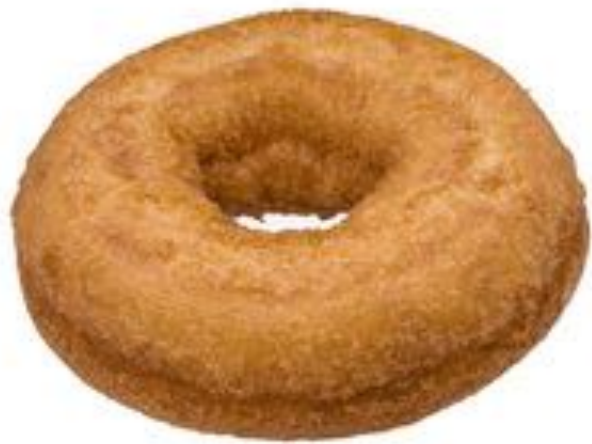
(minimum viable product)